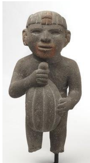
Man Carrying a Cacao Pod, 1440-1521, 36 cm Creative Commons-BY