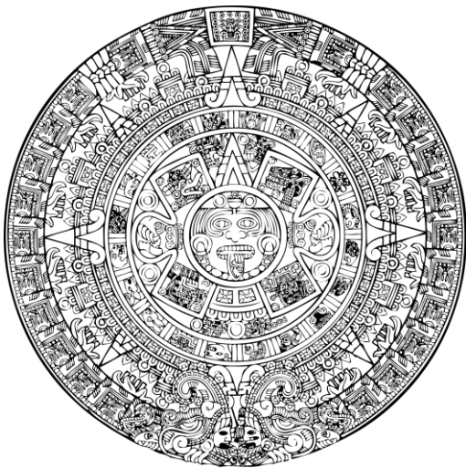
Sun calendar c1480 Sun stone Creative Commons Attribution-Share Alike 3.0 Unported license Keepscases