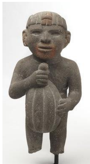
Man Carrying a Cacao Pod, 1440-1521, 36 cm Creative Commons-BY